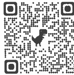
Scan the QR code or search "Waste Connect" wherever you download apps.